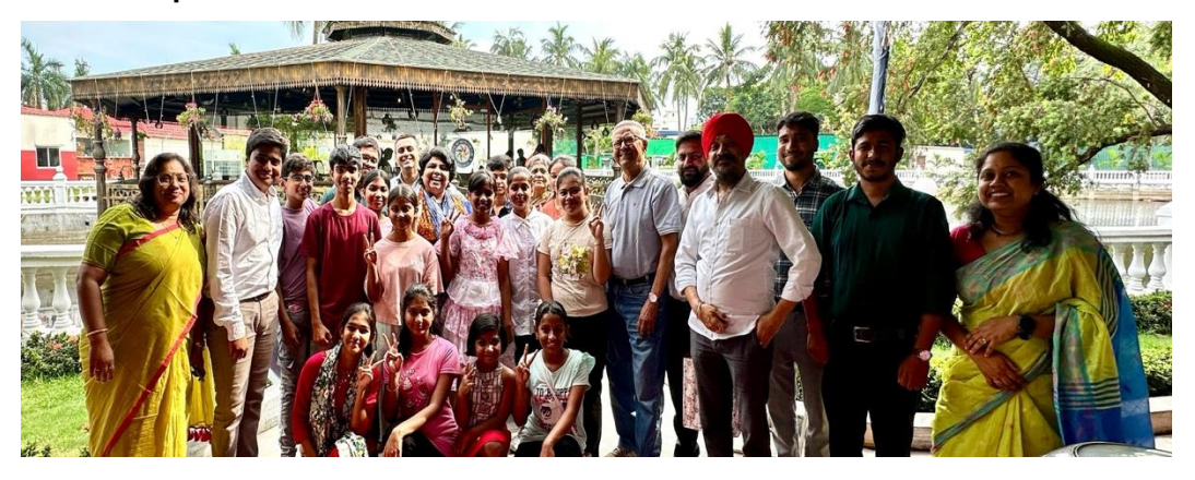
Swapnapuran children performing Bengali and English plays at Eastern Metropolitan Club